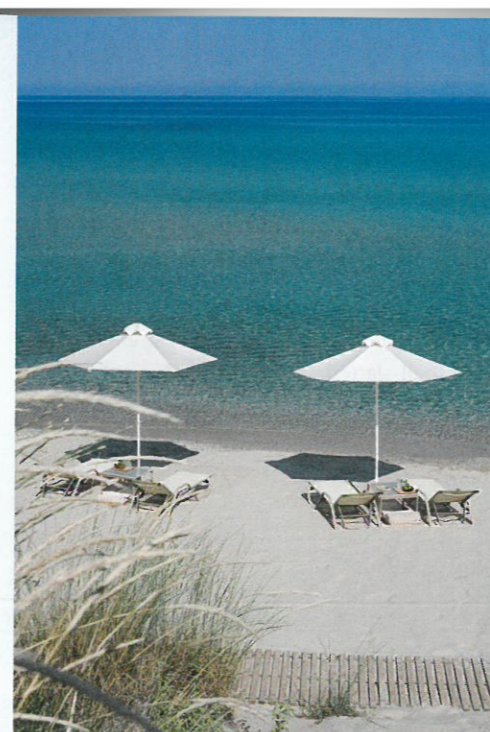
Sani marina. Left: Bousoulas beach